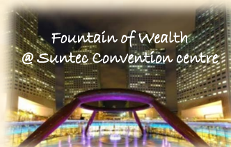
Fountain of Wealth @ Suntec Convention centre