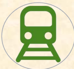
TM2:EMC in Railway Systems