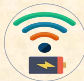
TM3:Wireless Power Transfer