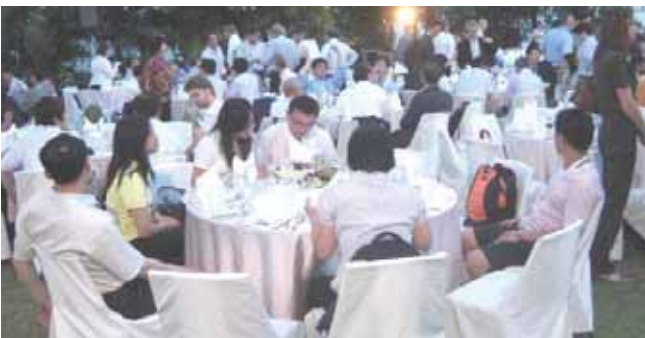
A banquet dinner was held during the Symposium at the Rasa Sentosa Resort.