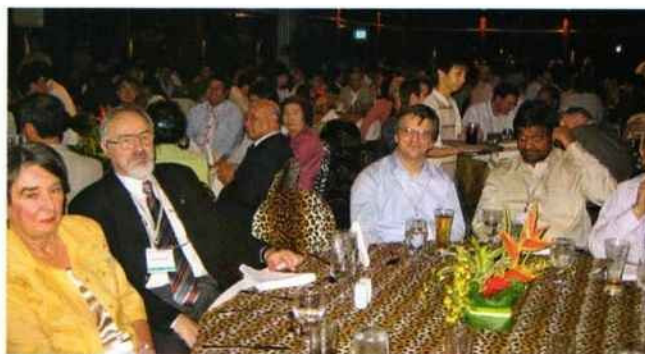
An elaborate banquet dinner titled "Singapore Night Safari" was held during the Symposium.

In conjunction with the EMC Zurich in Singapore, the "Asia-Pacific EMC Chairpersons Meeting" was held at Suntec City Singapore, with the goal to address EMC collaboration, EMC enhancement, and unification of EMC symposia in the Asia-